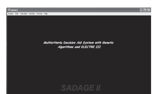
Figure 3 Main window of the SADAGE software